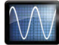
PURE SINE WAVE 90% LOWER DISTORTION RATE