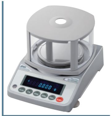
FZ-300iWP with small Breeze Break (standard on 1mg models)

For the user that wants it all, the FZ-iWP adds internal calibration to complement the IP-65 rated dustproof and waterproof features. Here is a balance that be used virtually anywhere.