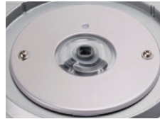
Sealed Pan Support