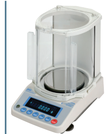
FZ-300i with optional Breeze Break FXi-11