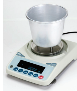
FX-3000i with optional Animal weighing pan FXi-12