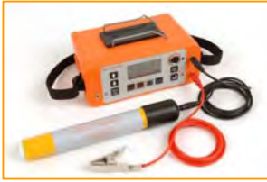
Elcometer 331 2 with Half-Cell and stainless steel