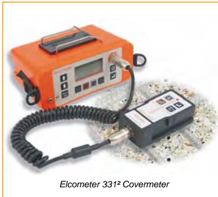
Elcometer 331 2 Covermeter