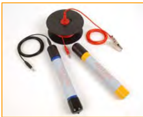
Elcometer 331 2 Half-Cell Kits

Elcometer 331 2 Covermeters with Half-Cell allow users to not only identify the location, orientation, depth and diameter of stainless steel rebar, but also the potential for corrosion all in one easy-to-use gauge.