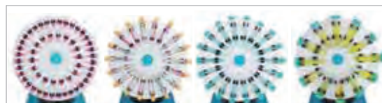
Tube holders (1.5ml / 5ml / 15ml / 50ml)