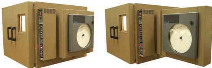
MODEL 21-350ER shown with optional window and chamber light & 10" "swing-out" circular chart recorder